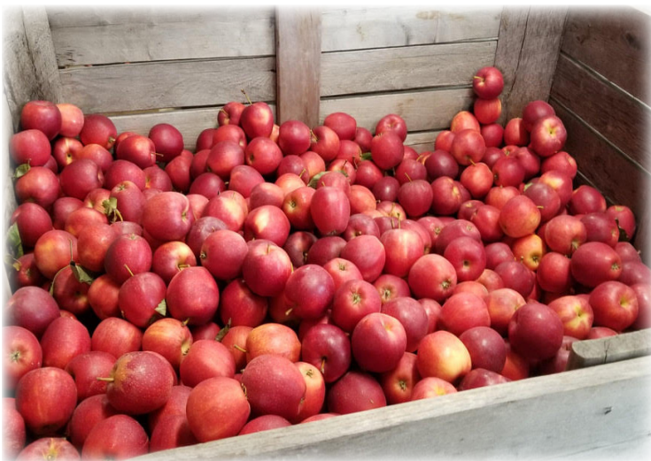
Apples picked from Meadow Farms’ Orchard: Check out meadowsapplefarm.com to get to know the “core” of this organization

If you’re an avid apple lover, or are just looking for a fun way to spend a fall day don’t forget to visit Meadow Farms this season.