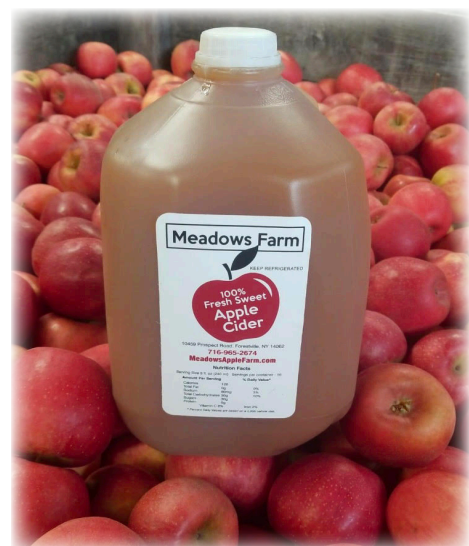
@MeadowsAppleFarm showcases its homemade apple cider on its Facebook page