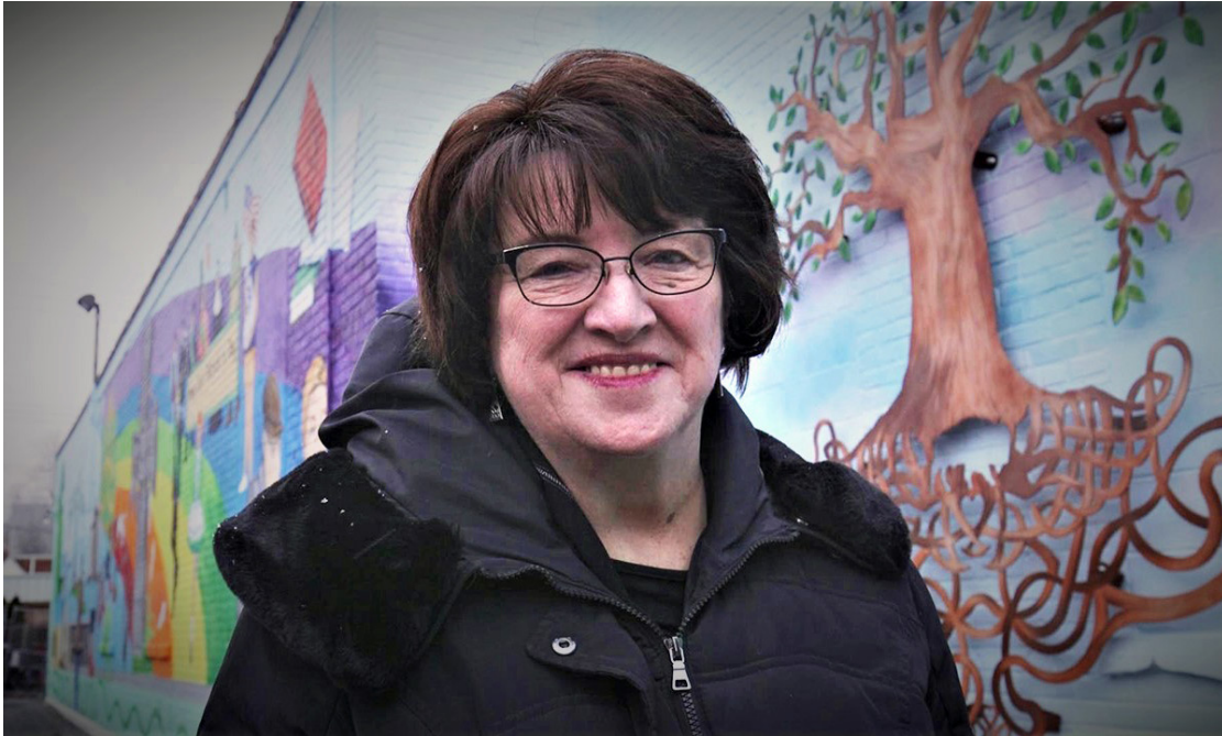
From Making Buffalo Home

This is a personal piece that did take me a bit to write, but this is about what she meant to me and to a whole community.