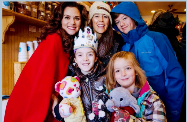
Hillarie Burton in Smauel's Sweet Shop